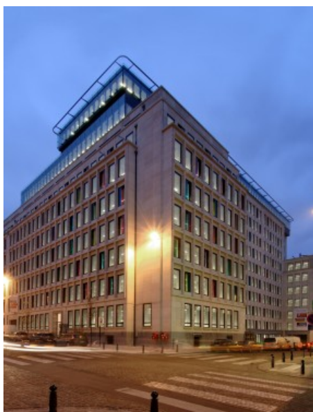
Â© Marc Detiffe