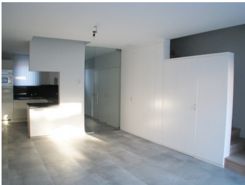
Interior. Living and stair.