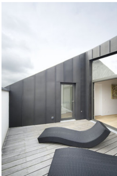
Â© StÃ©phanie Bodart