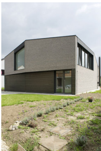
Â© StÃ©phanie bodart