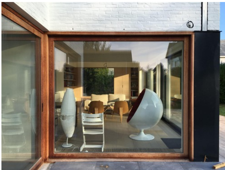
Â© opla architecture