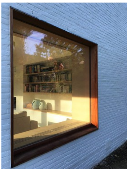
Â© opla architecture