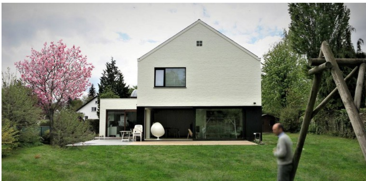
Â© opla architecture